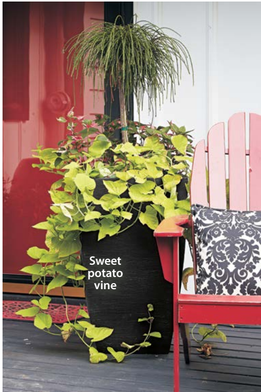
Sweet potato vine